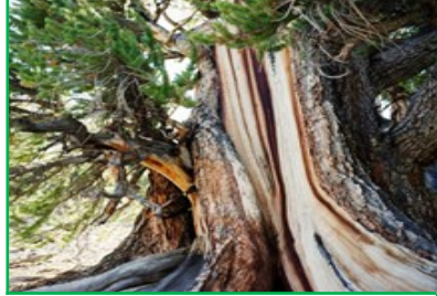
Bristlecone Pine White Mountains, California Up to 5,000 years old