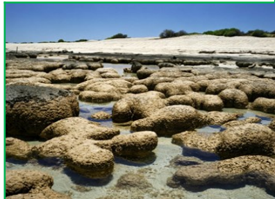
Stromatolites Carbia Station, Western Australia 2,000 to 3,000 years old