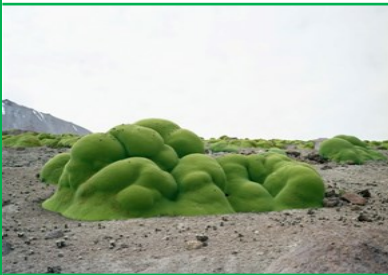
Llaretta Plant Atacama Desert, Chile Up to 3,000 years old