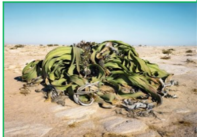
Welwitschia Mirabilis Plant Namib Naukluft Desert, Namibia 2,000 years old