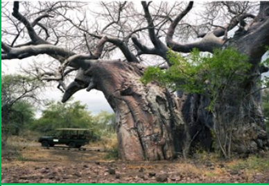
Pafuri Baobab Tree Kruger Game Preserve, South Africa Up to 2,000 years old