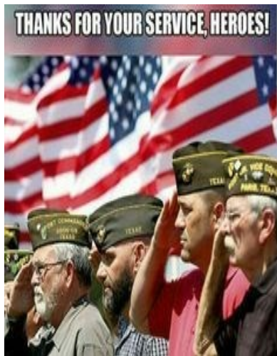
HAPPY MEMORIAL DAY