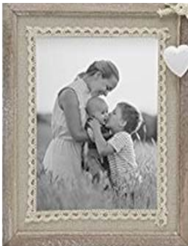
HAPPY MOTHER'S DAY

Mother's Day is May 13. Let her know she is special and appreciated. Memorial Day, May 28, will have the usual parade and memorial service in the park. Come join, support, and remember those who are fighting, and have fought for your freedom.